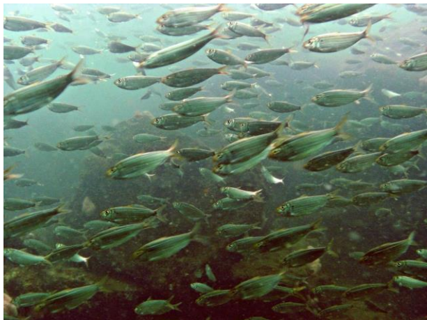
Fish & Fish Habitat