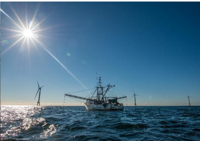
Socioeconomic impacts of offshore wind on fisheries